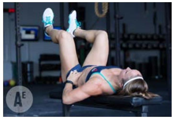
FIGURE 6. THREE-MONTH BREATHING

from fatigue. Assuming the athlete started in the correct position, maintaining trunk stability via IAP and co-activation of the trunk muscles, by the time the athlete drops to the floor from fatigue, they will have been holding the position with the ECSS. This is undesirable because it can reinforce pathological stabilizing strategies such as the ECSS. Training at or around FT is important, but frequent training over FT may result in pathological levels of activity of the ECSS.