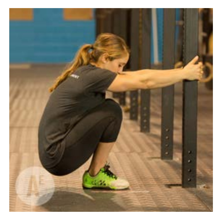
FIGURE 4. BACK BREATHING IN SQUAT

First, it is important to understand exercises that can be used to reduce the ECSS. The primary goal of trunk stabilization exercises is to improve the quality of the athlete's stabilization strategy. However, proper stabilization cannot occur if the ECSS is activated (12). Proper stabilization involves balanced co-activation of the trunk musculature. If the posterior chain is hyper-activated, this balanced co-activation is not possible. To relax or reduce the ECSS, these exercises place the athlete either passively or actively in a position with the spine flexed. It is important to note that this position does not train proper stabilization, but instead overcorrects the position to reduce the ECSS more quickly.