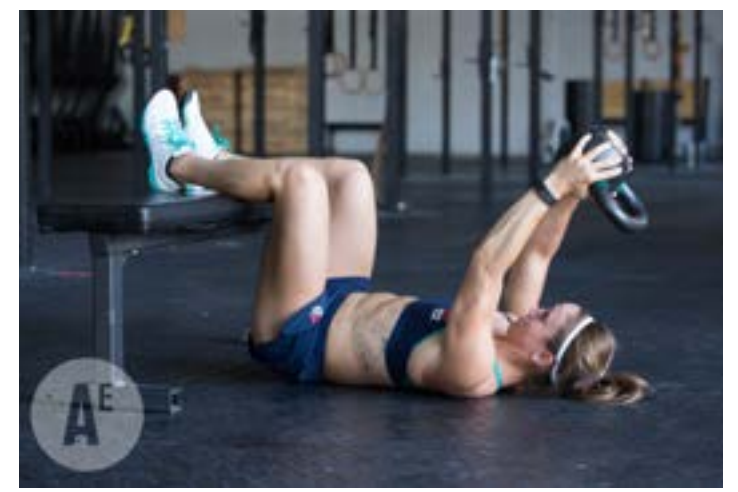
FIGURE 7. THREE-MONTH BREATHING WITH KETTLEBELL PULL-OVER

Suggested repetition scheme : If the legs are supported on the bench, the athlete can start 10 – 20 s holds, but should eventually be able to breathe and maintain IAP for more than 60 s without difficulty. The athlete may be surprised how difficult it is to simply breathe correctly in this position. If the athlete is holding an unsupported three-month position, 5 – 10 sets of 10 breath holds or six sets of 30 s holds is recommended.