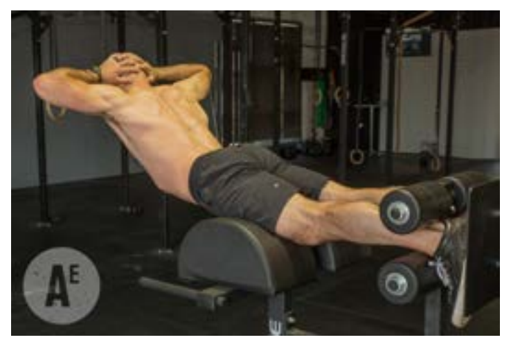
FIGURE 3. HYPEREXTENSIONS ON THE GLUTE-HAM DEVELOPER