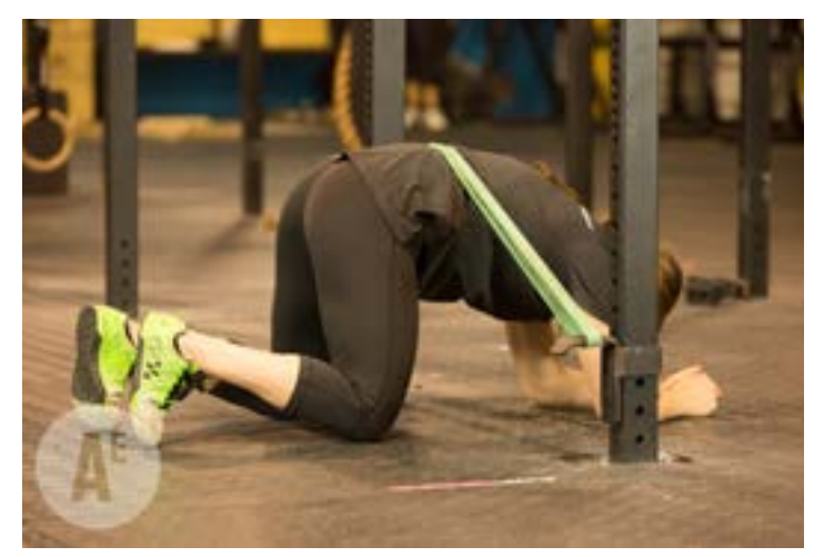
FIGURE 5. BACK BREATHING IN QUADRUPED POSITION ON ELBOWS (BANDED)

Suggested repetition scheme : five sets of 10 breaths after training, or one set of 10 – 15 breaths between sets. If the ECSS is completely deactivated, the athlete should not feel any stretch in the lower back during inspiration or expiration.